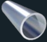
SEAMLESS TUBE ASTM A269